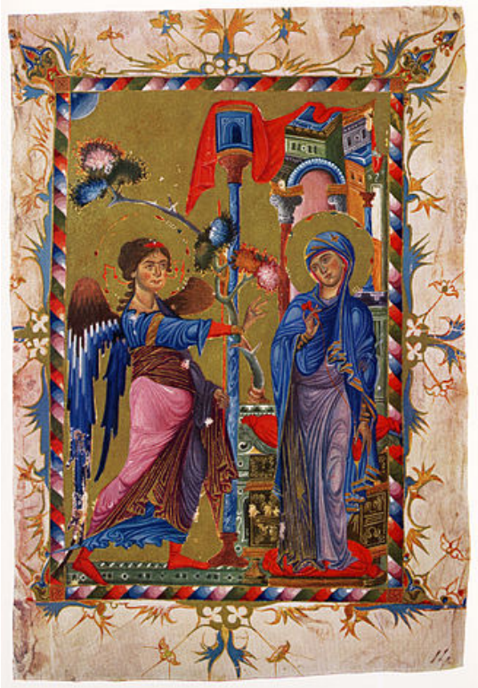
“Annunciation” by Toros Roslin